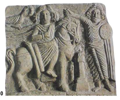
10. Gypsum low relief of "Asadu and Sadai", Dura-Europos, 1st - 2nd century AD, 46 x 46 x 8 cm.