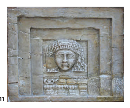
11. Ivory plaque of a "Woman at the window", Arslan Tash, Iron Age (8<sup>th</sup> century BC), 8 x 9.7 x 1.2 cm.